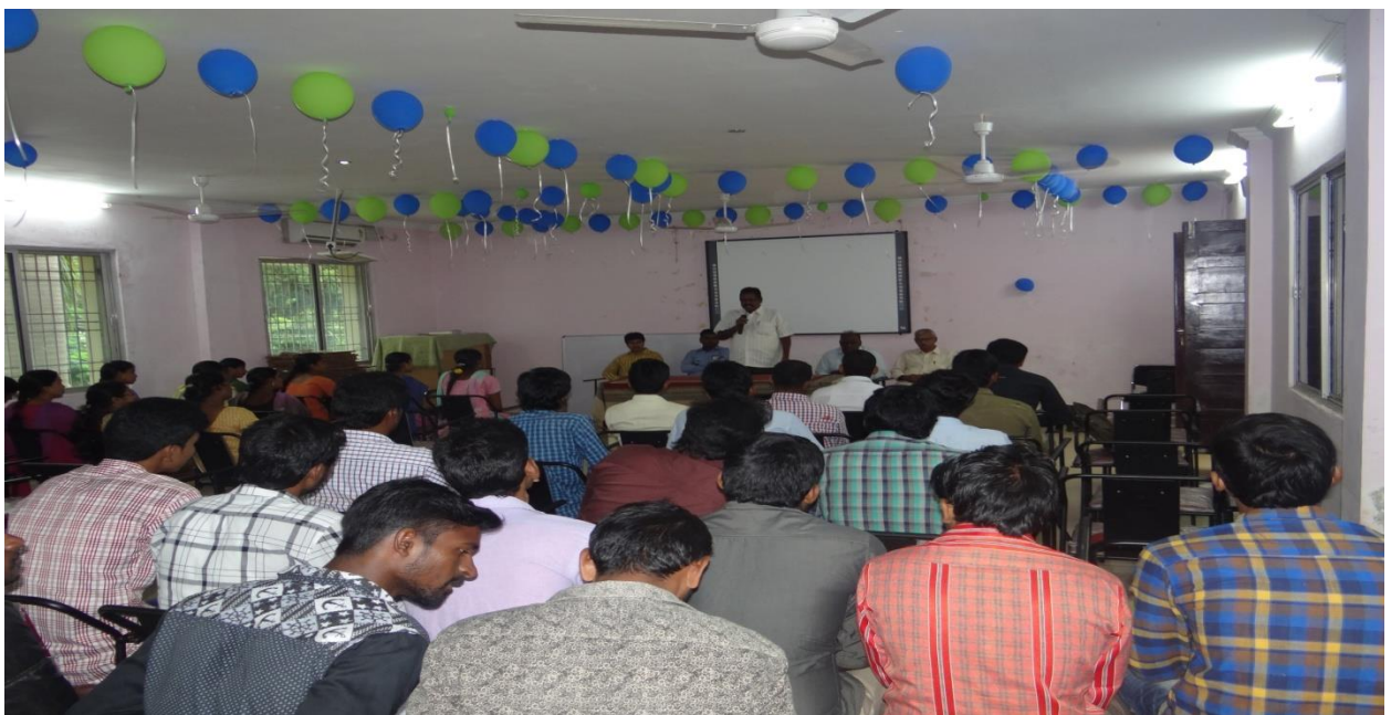
Partipated Students for the Campus Drive