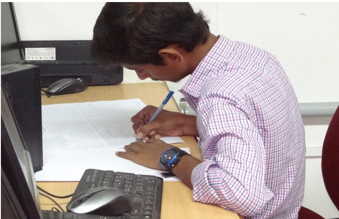
Written Test Conducted for Participants