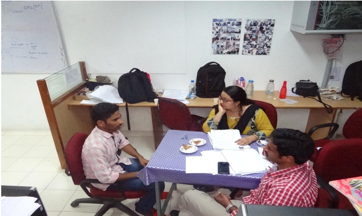
HR's Interview Process with Participants